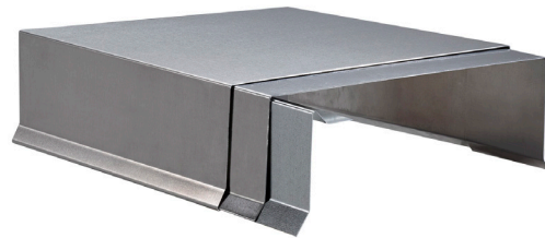
One Edge Coping (Tapered Version)

Edge Systems One® was developed with contractors in mind as a cost-effective solution, rather than fabricating in your own shop. One Edge Coping is a ANSI/SPRI/FM 4435/ES-1 tested product provided in 12'-0" lengths to simplify your projects and maximize your profits.